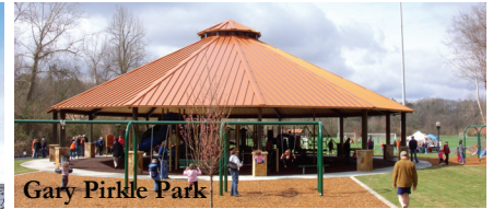
Gary Pirkle Park