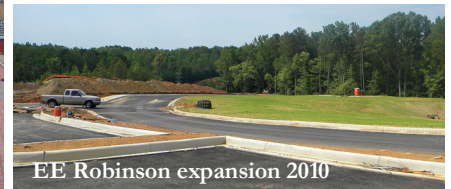
EE Robinson expansion 2010